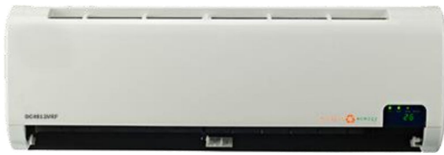
Wall Mount Indoor Unit (IDU)

12,000 BTU 48V DC Heat Pump VRF Dynamic Capacity Compressor 100% DC - No Inverter