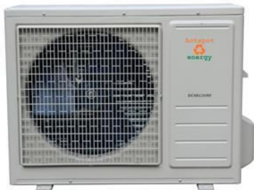
ODU (Outdoor Unit)

Variable Refrigerant Flow & Capacity means that the air conditioner is always the right size for the conditions and is never wasting power.